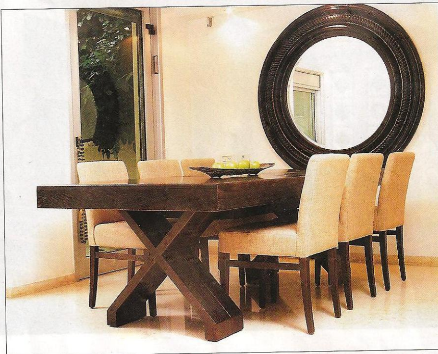
It's Modular An elegant, expandable wood table from Wishing Tree ; (opposite page) bedtime with a Sapapa , which comes in many sizes and colors.

drawers and its side doubles as a bulletin board. Zula, in Kiryat Bialik near Haifa, makes easy-to-clean desks, beds and armoires in vibrant colors—bright blues, purples, greens and oranges. Galmor Designers, with a factory in Emek Hefer, between Tel Aviv and Haifa, produces a bunk bed with a top bunk that is also a playhouse with windows, even sporting flower boxes on the sides. And for parents who wind up spending more nights than they want to admit with their young kids climbing into their beds, Galmor has adult bedroom sets with pull-out beds.