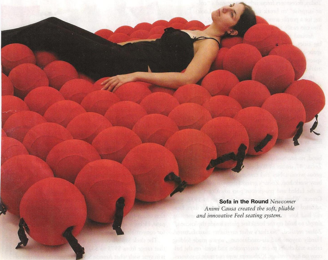
Sofa in the Round Newcomer Animi Causa created the soft, pliable and innovative Feel seating system.

With space-conscious designs and lively, modern styles, Israeli furniture is gracing living rooms, children's bedrooms and dining rooms from the United States to France to the Netherlands.