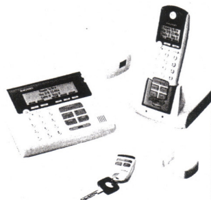
GIFT InGrid Home Security system (from $199; $30 monthly professional monitoring fee)

BRAG FACTOR "You touch my primo hooch and I'll know about it." SPIEL FOR THE GUYS Unlike most professional security systems, this one you install yourself. The wireless sensors communicate with the base station through the home's broadband connection, which means they can be put anywhere. And not just on things like doors or windows—this one can even go on the cabinet where the good Scotch is hidden. Because InGrid is linked to the Internet, it can be monitored anywhere, including on a cell phone. There's even an "instant alert" feature that sends a text message every time someone walks into any room you select—even the room with the Macallan, and even if it's just the cat. Visit ingridhome.com.