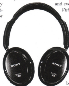
GIFT Sony MDR-NC500D Digital Noise Canceling Headphones ($400)

BRAG FACTOR "You touch my primo hooch and I'll know about it." SPIEL FOR THE GUYS Unlike most professional security systems, this one you install yourself. The wireless sensors communicate with the base station through the home's broadband connection, which means they can be put anywhere. And not just on things like doors or windows—this one can even go on the cabinet where the good Scotch is hidden. Because InGrid is linked to the Internet, it can be monitored anywhere, including on a cell phone. There's even an "instant alert" feature that sends a text message every time someone walks into any room you select—even the room with the Macallan, and even if it's just the cat. Visit ingridhome.com.